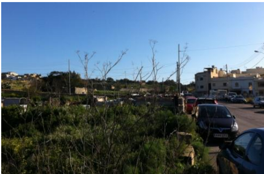
Scenario 2 – Balanced approach favouring environmental issues

3.5 The Balanced Landscape Option – Scenario 2 postulates that RES development will be established respecting landscape features. Although priority will still be given to urban areas, it will be assumed that only the targets of the Zero Option will be reached, and the eventuality of not attaining the wind energy targets will be considered, hence putting more pressure of increasing PV farms in rural areas. Such RES plants will be integrated as much as possible into the landscape.