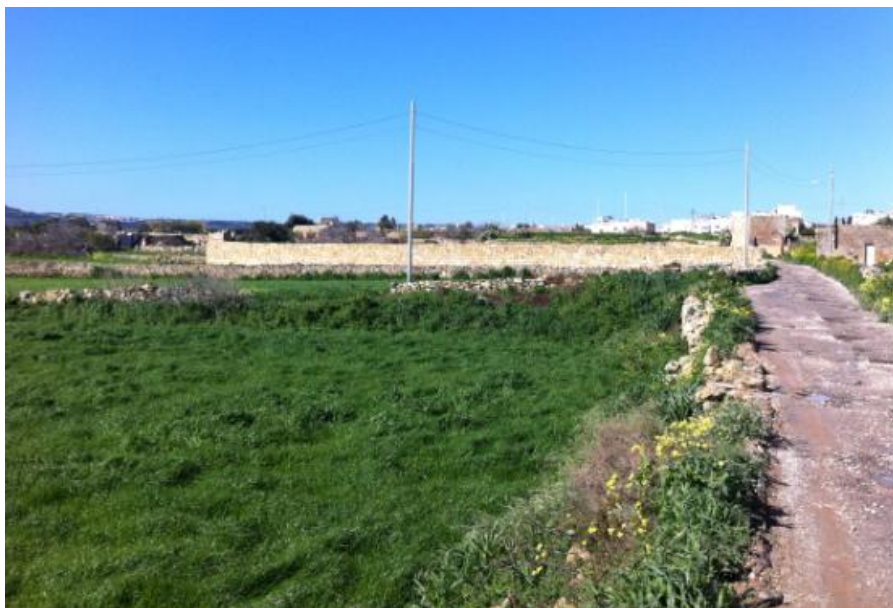
Scenario 3 – Balanced approach favouring technical issues

In this scenario, it is estimated that PVs will contribute 200GWh pa of electricity generation, located in rural areas apart from the amount specified in the zero option. The land take-up will therefore amount up to 1.35sqkm. Most PVs will be located in technically favourable areas, and technical considerations will be the most influential factor.