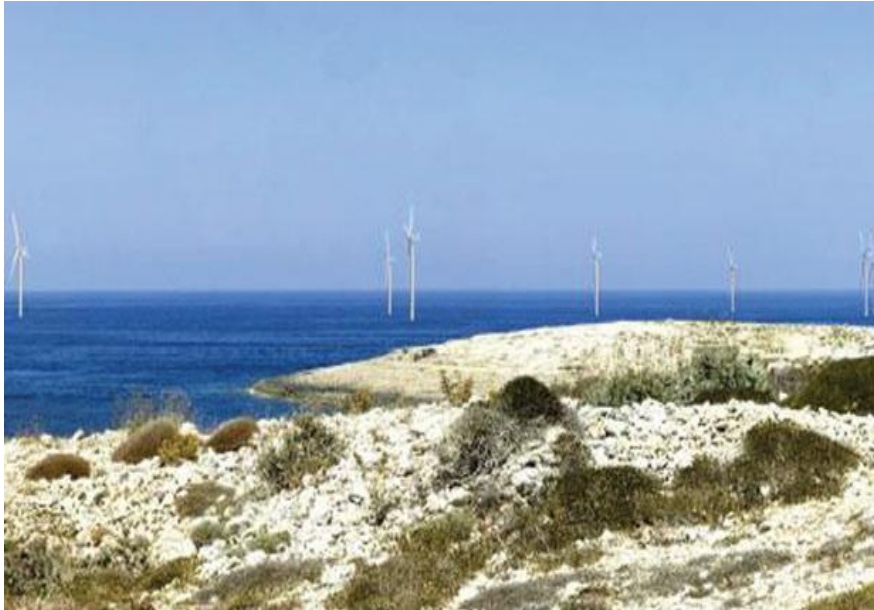
Scenario 0 - Artist's impression of the proposed wind farm

Given the current situation whereby studies are still being carried out and requested by the authorities related to the wind farms, including the Malta Environment and Planning Authority, it is felt that it will not be prudent to investigate this option in more detail.