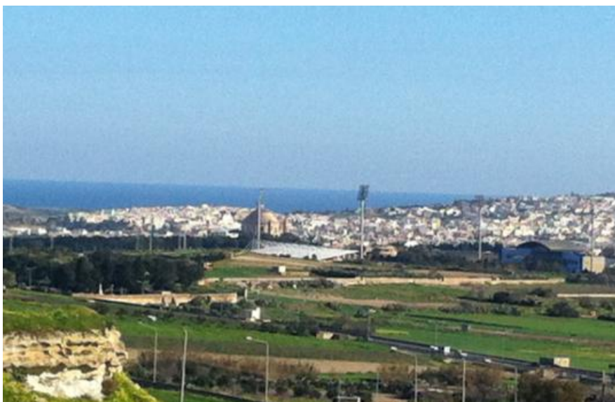
Scenario 1 – Environmental considerations given maximum importance

Using very broad assumptions for comparison purposes only, if one assumes that with the current system the PV would occupy 15% of the roof area of the uppermost floor, the required overall area would go up to 0.8sqkm. Assume further that only 30% of roof space