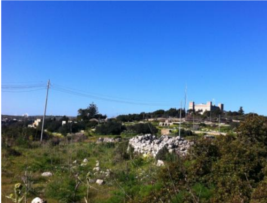
Scenario 4 – Technical considerations given maximum importance

In this scenario, landscape and visual issues will not affect PV farm location. These farms will contribute over 200GWh pa of electricity generation and will cover more than 1.35sqkm in area. PVs will be located in technically favourable areas, and technical considerations will be the influential location factor.